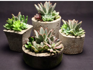
TABLE TOP PLANT ARRANGEMENTS: SIZES ARE WITH PLANTS

HOW TO ORDER: Email order to order@tlc-florist.com/ Mail hard copy to: P.O. Box 538, Rex, GA 30273 or 121 Pine Dr., Stockbridge, Ga 30281 / or Fax to (770) 474-4676 Questions? Please email plant@tlc-florist.com or call (770) 507-6777 * PRICES IN BOLD PRINT ARE DISCOUNT PRICES FOR ORDERS RECEIVED 2 WEEKS PRIOR TO EXHIBITOR MOVE-IN